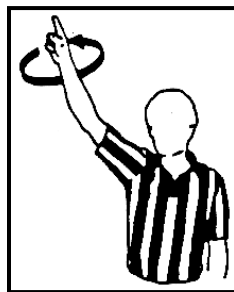
Shot Clock Reset